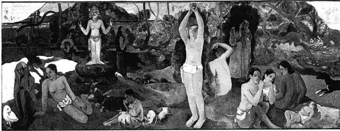
Figure 1.1 Where Do We Come From? What Are We? Where Are We Going? Paul Gauguin, 1897–98. [Museum of Fine Arts, Boston]

short, the kilogram (kg) is awkwardly tiny, and the second (s) is awkwardly brief. Fortunately, we can adopt the units that have been developed by astronomers for dealing with large distances, masses, and times.